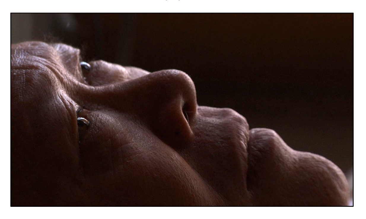
64 min., HD, Color, Stereo & 5.1 Surround, 2013 Chinese, English & Spanish with English Subtitles

While living in a "shift-bed" apartment in the heart of New York City's Chinatown, a household of immigrants shares their stories of personal and political upheaval.