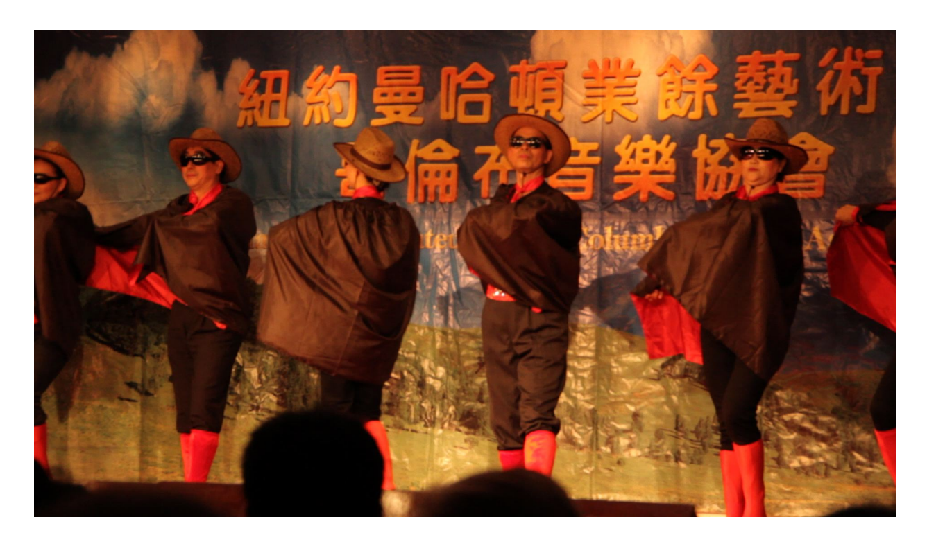
Still from Your Day is My Night